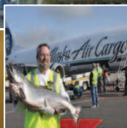
36 Alaska Airlines ensures freshness of seafood