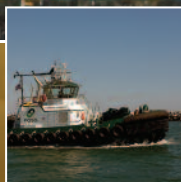
15 Green works for Alaska-Washington trade