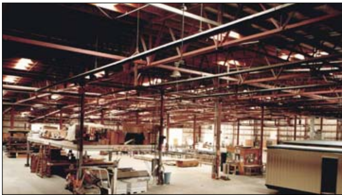
Palmer manufacturing facility

state despite economic ups and downs through the years. Arctic Structures has grown into a multi-faceted, diversified company with a variety of products and services to offer.