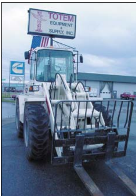
Totem Rentals Inc. provides equipment rental and leasing and Totem Inc. provides fabrication and engineering.