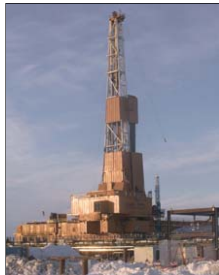
Doyon Rig 19 (CD3)