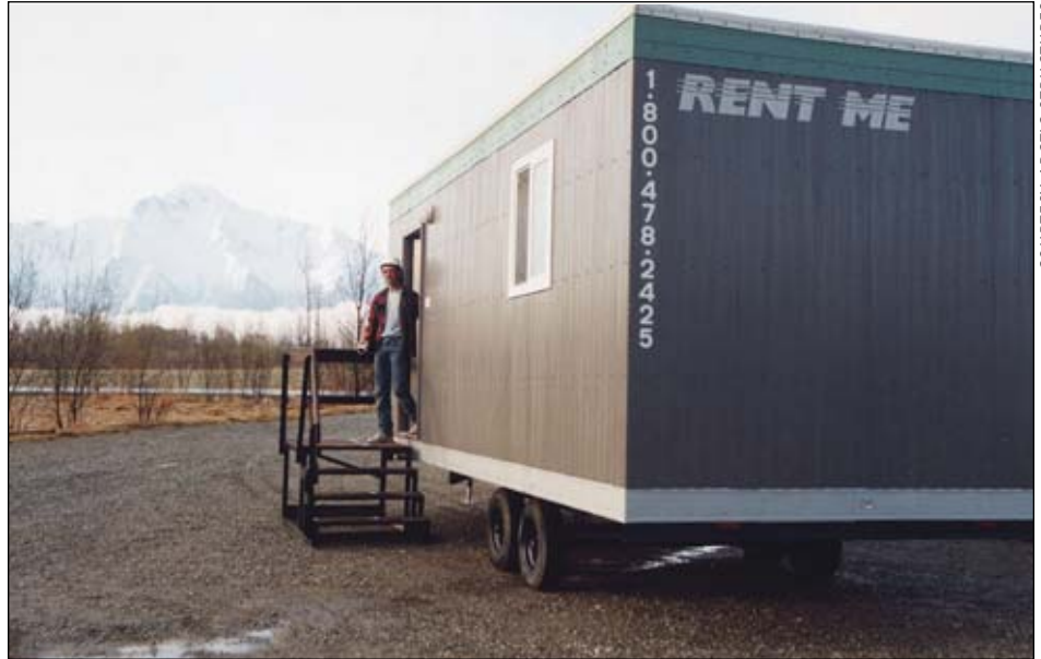
A typical rental office unit