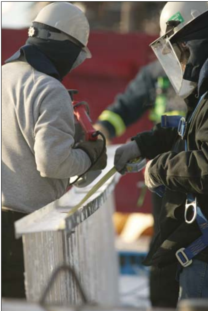
Conam workers check their measurements