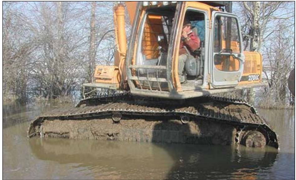
The C-Lock mat provides a firm footing even in flood conditions.

I am a published writer and have a broad background in public relations. I've been responsible for large advertising/pro-