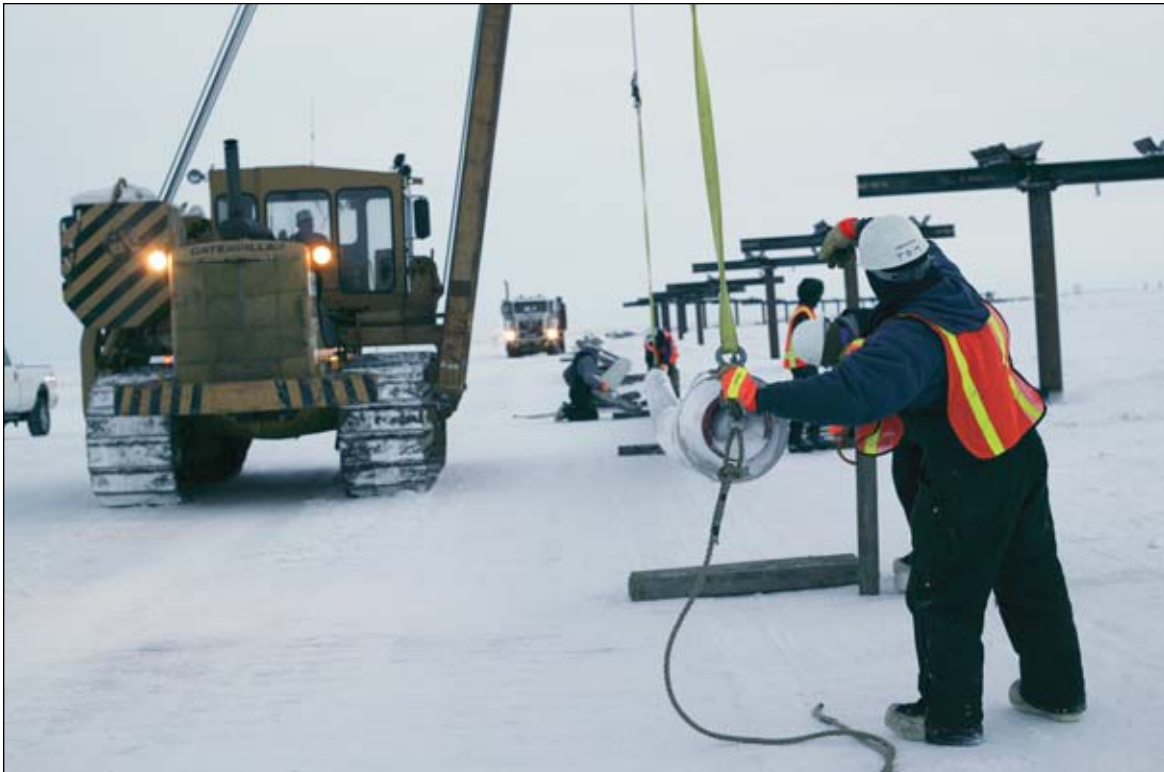
Pipefitters with Swallowing Construction string pipe