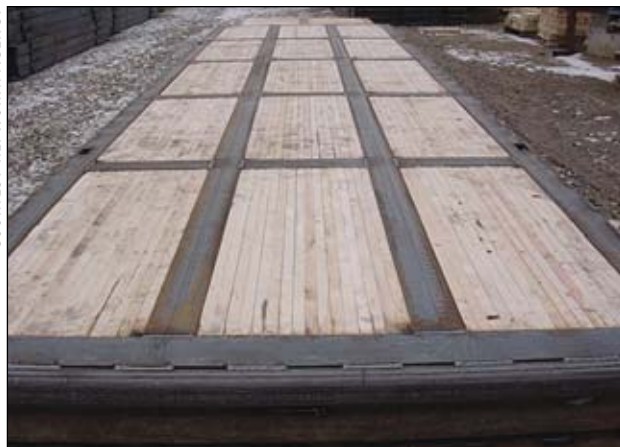
Drill rig mat designed for Alaska's heavier drill rigs. Size 8 feet by 30 to 40 feet or designed to your specs, four rail steel, 2 foot by 6 foot laminated wood beams, repairable in the field with a cutting torch and welder, 34,000 psf, side fork deflectors. Sale/rent

A. My contact information is: Hepworth Agency, 612 E. 3rd Avenue, Anchorage, AK 99501, telephone: 907-272-5766, fax: 907-274-5766, and email: canrouak@gci.net.