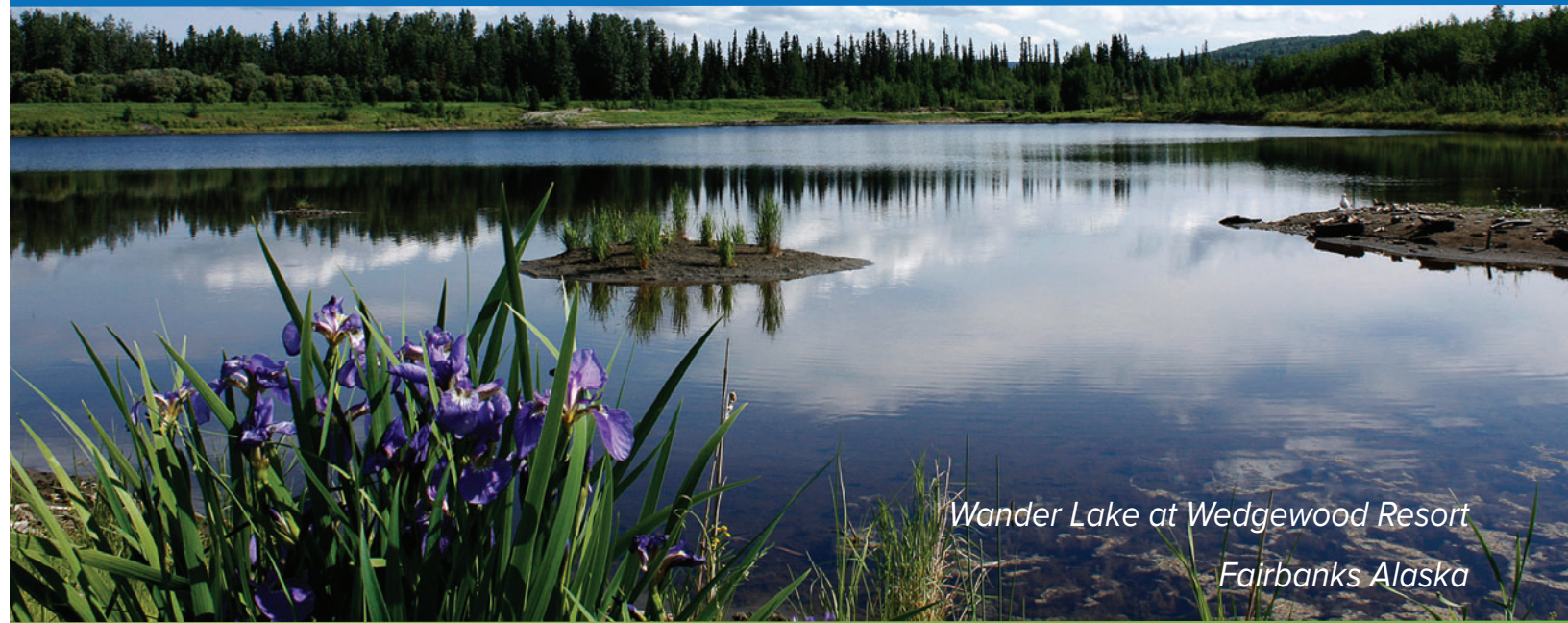
Wander Lake at Wedgewood Resort Fairbanks Alaska

Fountainhead Hotels your first choice in Fairbanks