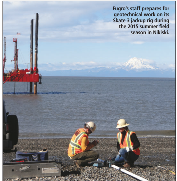
Fugro's staff prepares for geotechnical work on its Skate 3 jackup rig during the 2015 summer field season in Nikiski.

A. The ability to combine local knowledge with global resources is certainly one of our biggest strengths, as evidenced by our work on the AKLNG project. With an eye toward cost man-