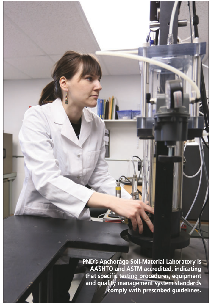
PND's Anchorage Soil-Material Laboratory is AASHTO and ASTM accredited, indicating that specific testing procedures, equipment and quality management system standards comply with prescribed guidelines.

We have also recently been involved in Exxon Neftegas Ltd.'s development of the Sakhalin-1 Project in Sakhalin Island, Russian Federation; design of Umm Qasr Piers 1 and 2 for the Iraqi Navy;